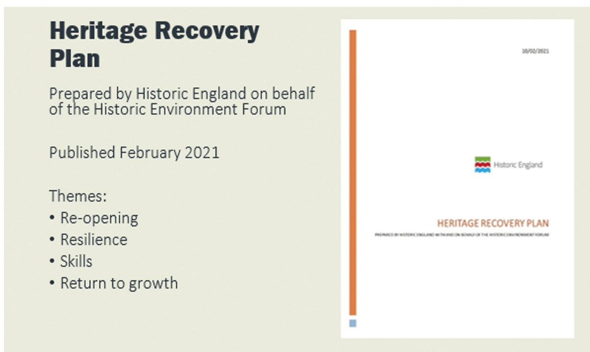
Fig. 2 The heritage sector's 2021 Heritage Recovery Plan.

albeit under strict Covid regulations. However, the Task Group kept in close touch with this activity and represented any issues which emerged, for example in relation to promoting practices to support safe working on excavations.