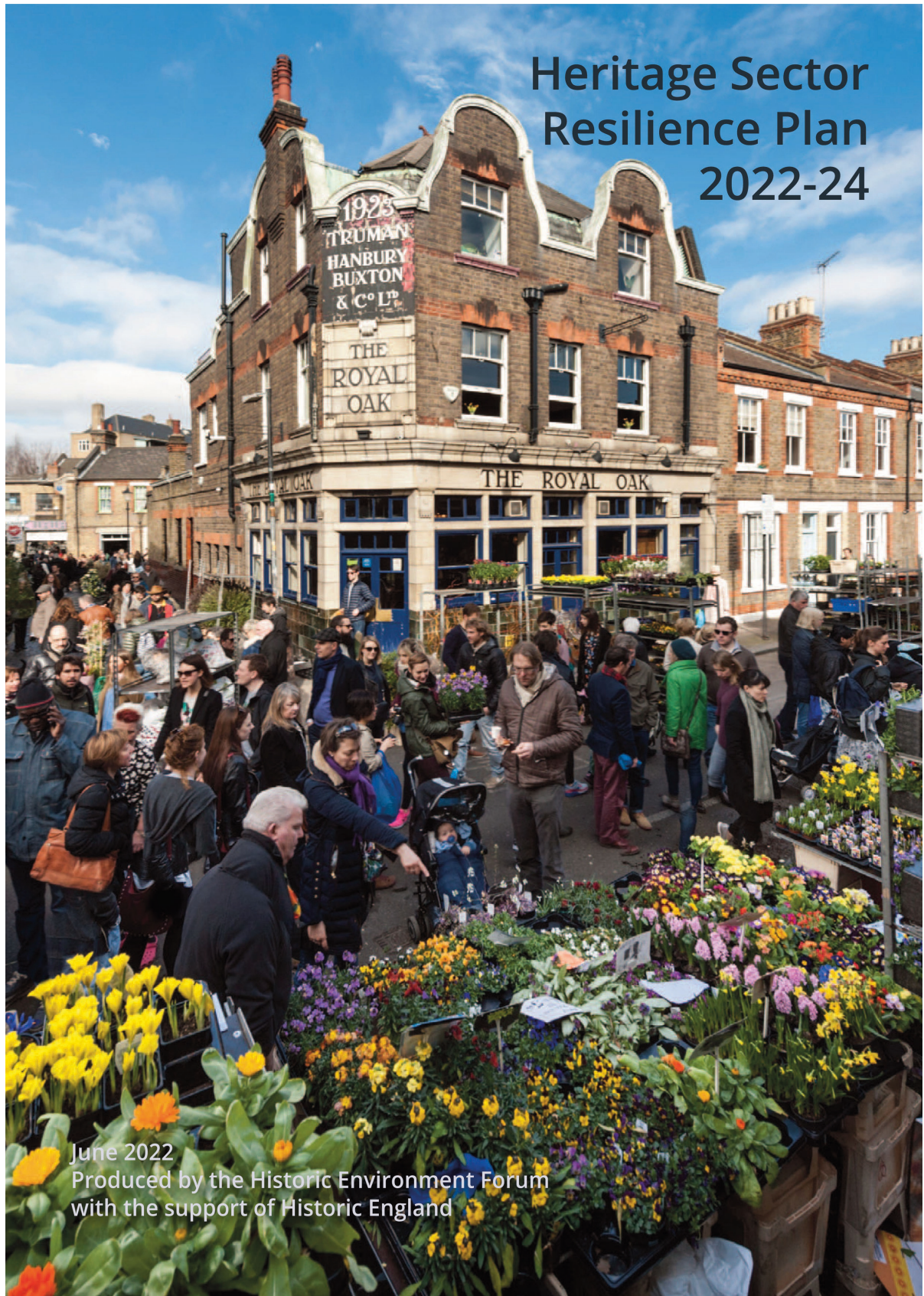
Fig. 4 The Heritage Sector Resilience Plan 2022-24.